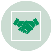
SCOUT AND INTEGRATE DIRECTLY